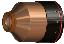
Nozzle Retaining Cap 90-0754